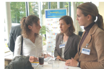
“Change on Borders” representatives in a conversation

gral part of this event was the organisation of three thematic workshops putting emphasis on the topics (a) economy, innovation and technology, (b) sustainability and infrastructure as well as on (c) society and integration. These workshops offered practical support for a successful participation in projects of European territorial cooperation by presenting concrete cross-border related project ideas and establishing networks among the participants and beyond in order to find the right partners for cooperation.