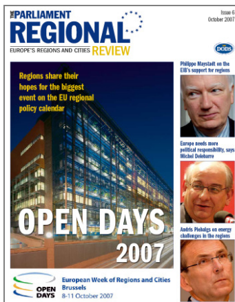
Regional Review issue 10/2007

The RFO „Change on Borders“ placed a two-pages article within the ‘Regional Review’ issue of October 2007 published by the Parliament Magazine. The ‘Regional Review’ is a regularly published magazine (5 times a year) providing an authoritative forum to examine the impact of EU investment in the regions. It gives EU institutions and decision makers the opportunity to read about developments and best practice examples in regional policy and gives regional policy stakeholders and projects a platform to inform EU decision makers about the work they do.