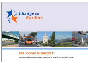
10-pages brochure on cross-border cooperation

In the framework of the RFO "Change on Borders", the achievements and results of this project were compiled in a comprehensive manual for cross-border cooperation including a check-list for cross-border project development. The manual which was introduced to the public during the Final Conference is based on the main objective of the RFO which is to help further dismantling borders and border-related barriers in Europe through a stimulation of new cooperation opportunities in all aspects of daily life. This manual provides a holistic approach and primarily focuses on the criteria and conditions for cross-border cooperation based on the experience gained by the RFO stakeholders.