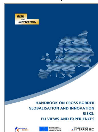
Handbook "Risk & Innovation"

The SWG "Risk & Innovation" mainly targeted the exchange of know-how and methods in order to cope with cross-border risks related to globalisation with the aim to raise the awareness about industrial, environmental, health- or human-related cross-border risks. One major result is the consolidation of the SWG's achievements in a handbook of best practice called " Handbook on cross-border globalisation risks: EU views and experiences ". It is addressed to all actors at local, regional and national level dealing with different aspects of industrial, environmental or human related risks who would like to get to know more about it and exchange their experience and best practices.