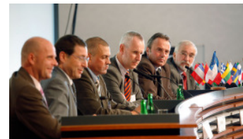
Participants of the panel discussion

the awareness for common problems and favoured the elaboration of possible solutions in border regions. It has become evident that the presence of regional networks and partnerships is crucial for effective mutual learning and the transfer of knowledge.