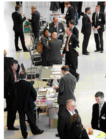
Sub-project stands in the framework of the conference

sented at project stands in the framework of the Final Conference of the RFO "Change on Borders" which took place on 23 rd October 2007 in Düsseldorf, Germany.