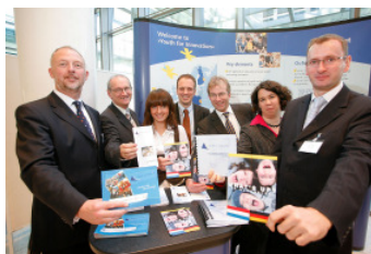
Participants of the SWG "Youth for Innovation"

were given by the exemplary presentation of three sub-theme working groups (SWG) in the field of harmonisation of cross-border geo data infrastructure of border regions (Cross-SIS), the joint marketing initiative for the cycle path along the river Rhine (Rhine Cycle Path) and the increase of regional innovation capacities through the testing of training and educational tools (Youth for Innovation). The common work within the SWGs has highlighted that the aims of cross-border cooperation have to reflect all partners' needs, as only a "win-win situation" providing benefits for all partners can be a real stimulus for cross-border cooperation.