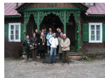
Representatives of the SWG "RiverCross"