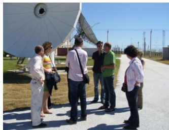
Study visit to a military camp

On the second day, the participants had the opportunity to learn more about the difficulties and challenges which border regions with abandoned military camps have to face while visiting the facilities of the former American radio station "Voice of America" in the surroundings of Kavala.