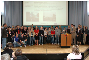
Award for 16 excellent mini innovation projects

Groningen offering Oldenburg specials in order to make the city more attractive for them to visit. The best 16 mini projects were awarded for the realisation of an outstanding mini innovation project.