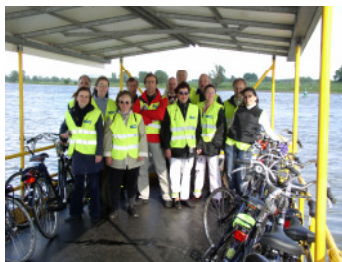
Participants of the SWG "Rhine Bicycle Path"

The SWG "Rhine Bicycle Path" organised its final workshop on 24/25 May 2007 in Basle (CH). Within this workshop, the target of the product "Rhine Bicycle Path" was illustrated and the new flyer and the project's website (both available in 4 different languages) were presented. Furthermore, an outlook on the future cooperation of this project was given.