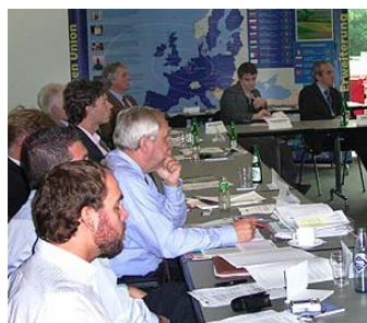
Participants during the closing conference

For more information, please see: www.change-on-borders.net/activities/knowledge_roadmap.php